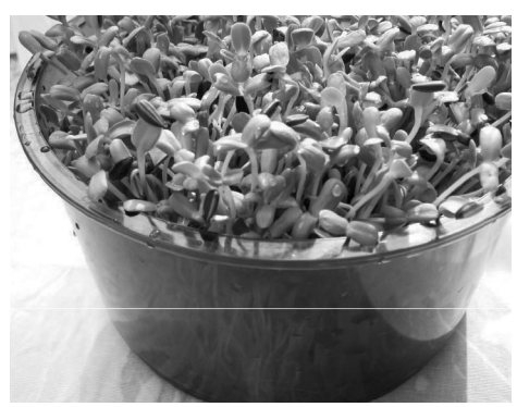
Sunflower sprouts grow 8-10 inches tall in the Freshlife Sprouter.

Normal daylight is all you need to develop deep green looking sprouts. If your Freshlife location is shady, you can remove the cover once the sprouts have started greening (usually the last 2-3 days before harvest). The Freshlife can operate safely without a cover during this period. In addition to more light, the sprouts also get more air which is especially beneficial in hot weather.