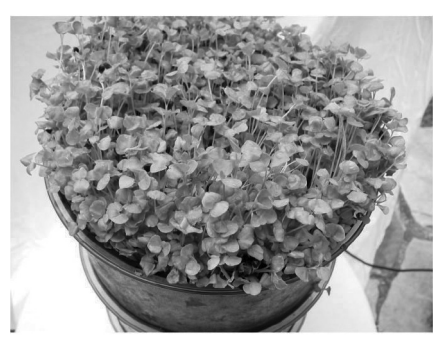
Ten inch tall buckwheat sprouts growing in the Freshlife sprouter.

Your head is clogged... your sprinkler head, that is! Switch sprinkler heads and clean the clogged one. (See instructions on p. 10)