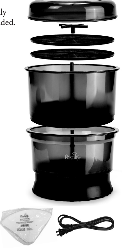
Parts are listed according to this photo from top down