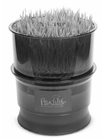
Wheatgrass grows easily and without soil in the Freshlife Sprouter